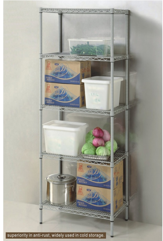
superiority in anti-rust, widely used in cold storage.

Shelves are packed 4 to a carton, except 54 inch, 60 inch, and 72 inch. lengths, which are packed 2 to a carton. Black round protection between the shelves, plastic clips are included in each carton. Post: polybag, transparent, packed 4 pcs to a carton. (Optional) One brown carton board for protection against knife on the top. (Optional)